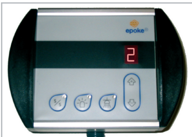
The EpoSet remote control is installed in the driver's cab for control of start/stop of spreading, spreading width, orange warning light and working lamp.